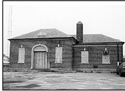
Silver Spring Train Station.

along Fenton Street in the vicinity of Montgomery College. If no site can be found, it is possible that the old station will remain in its current location.