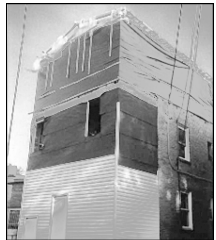
This illegal third story addition is being torn down.

We believe that our action was in part responsible for this good result to what could have been an awful eyesore on a prominent property. ❖