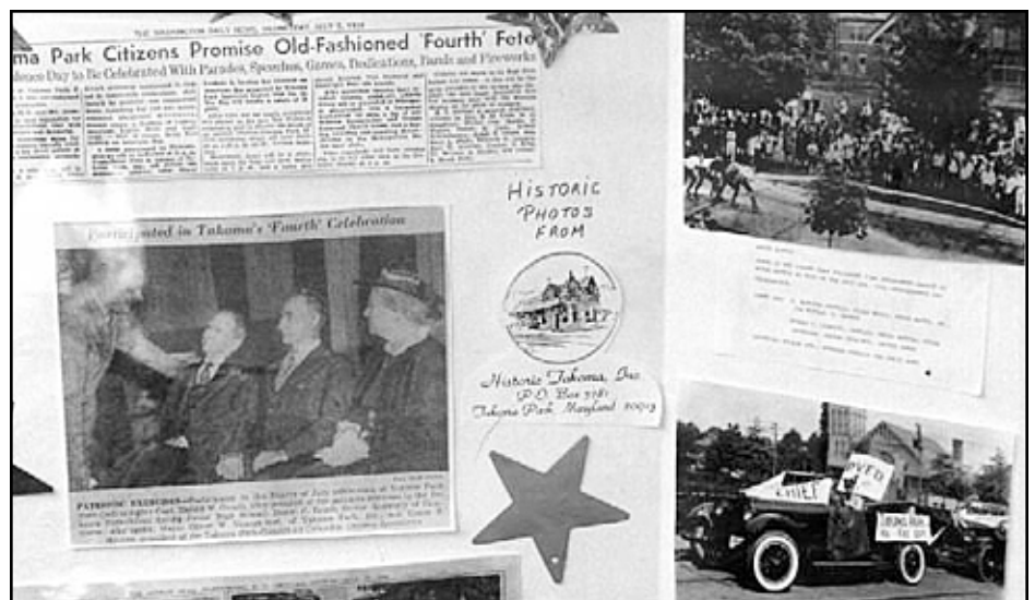
Historic Takoma helped to celebrate Independence Day with this exhibit in the Shampoo window.