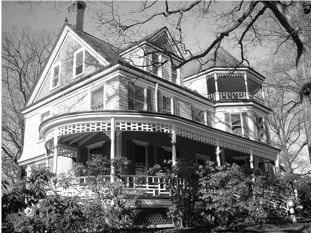
The Cady Lee Mansion will be part of this year's tour.