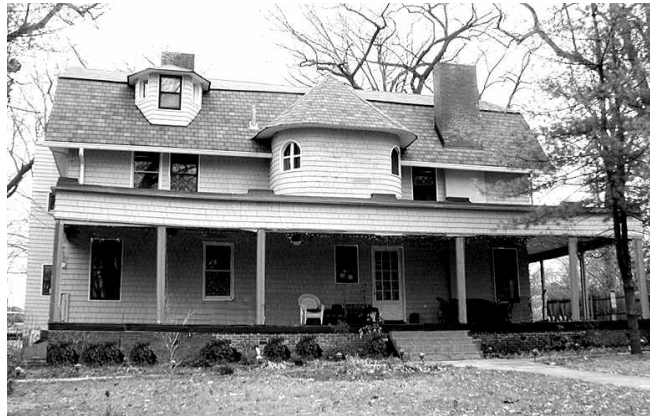
The Boat House currently under restoration.

Featured on the tour will be the Cady-Lee Mansion and the "Boat House." The Cady-Lee, a Queen