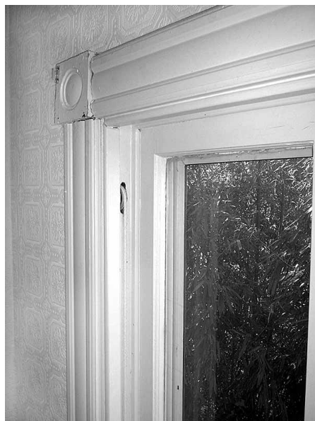
Century old window with sash cord.

Historic district residents should also be aware of the consequences of illegally replacing original windows beyond the damage to style and integrity of historic properties. In Maryland, for example, if windows are illegally replaced with new vinyl models, the county can and will require replacement of the new windows with appropriate wooden ones. Moreover, changing windows on an outstanding or contributing historic structure may make that structure a noncontributing resource that is no longer eligible for state (20%) and county (10%) rehabilitation tax credits. There are no tax incentives in DC, but owners can be compelled to remove illegal replacement windows.