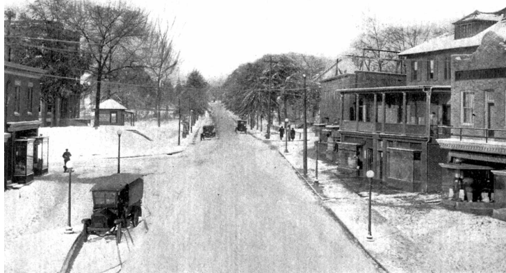
From the McMurdie collection, Cedar Street in the snow.