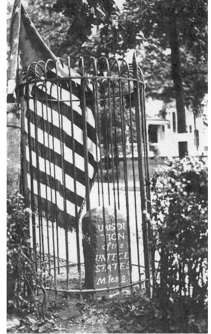
The Boundary Marker in 1917.