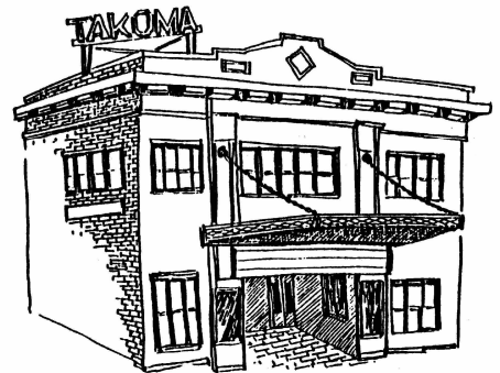
Line art of the Takoma Theatre used in the first Takoma Park Folk Festival. www.takomatheatre.org

Did you know that the first Takoma Park Folk Festival in 1978 was held to raise money for the Takoma Theater?