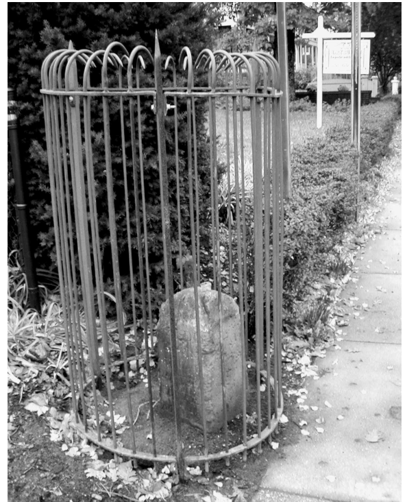
The Boundary Stone today, all restored.