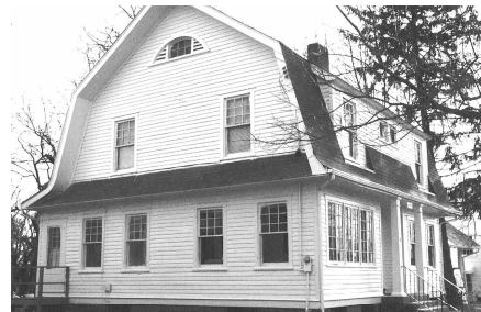
6833 Piney Branch Road, is having most of its historic windows replaced, with its distinctive casement windows to be preserved and repaired.