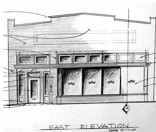
Architectural drawing of the exterior of HTI building on Carroll Avenue.

The new HTI headquarters at 7328 Carroll Avenue is still a work in progress, as anyone who has passed through the Junction can readily see, but we have plans to build out the space over the next year or so. The first step will be repairing the damaged façade. HTI has applied for a Main Street Façade Improvement Programs matching grant from MainStreet Takoma, and hopes to begin work on the front of the building as soon as possible, if that funding is obtained. In the mean time, HTI