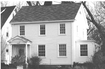
6825 Piney Branch Road, is having its historic windows repaired, with only a few in the rear to be replaced.