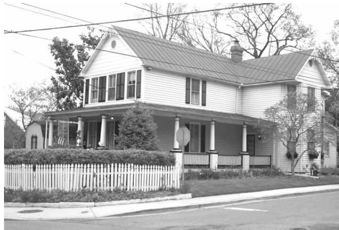
This lovely Victorian will be one of the homes included on the 2007 House and Garden "Carroll Connections" Tour.