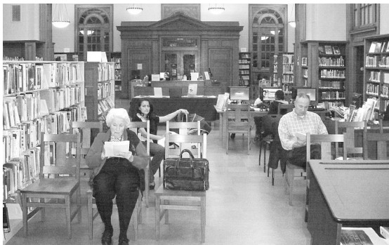
The Takoma collection is housed in the recently renovated Takoma DC Public Library.