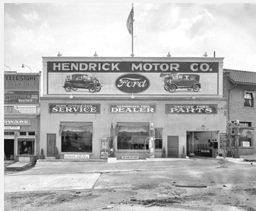
Hendrick Motor Company was on Laurel Avenue. This photo is from between 1918 and 1928.

We will scan and promptly return your photos, providing you a high resolution digital copy if you would like.