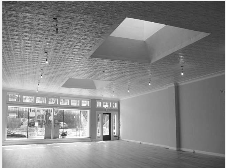
The interior of 7328 Carroll Avenue.

It is a pleasure to announce that we will hold guided construction tours at 7328 Carroll Avenue for our members as part of our annual meeting on December 6th. We have just completed a major phase of building restoration with the skill of Rick Leonard and his firm, Heritage Building and Renovation. With the financial assistance of Main Street Takoma façade improvement grants and revenue from the 2009 House and Garden Tour, Rick completed the remaining work for the front bay window façade and restored two large rear facade windows. These front and rear windows, together with the two newly restored skylights, provide a generous amount of natural light for the building, and restores it to its original appearance for the first time in over sixty years. Currently in progress is the installation of 16 school house-styled pendant lights and three old-fashioned ceiling fans, to be generously donated by the Peterson Companies of Silver Spring.