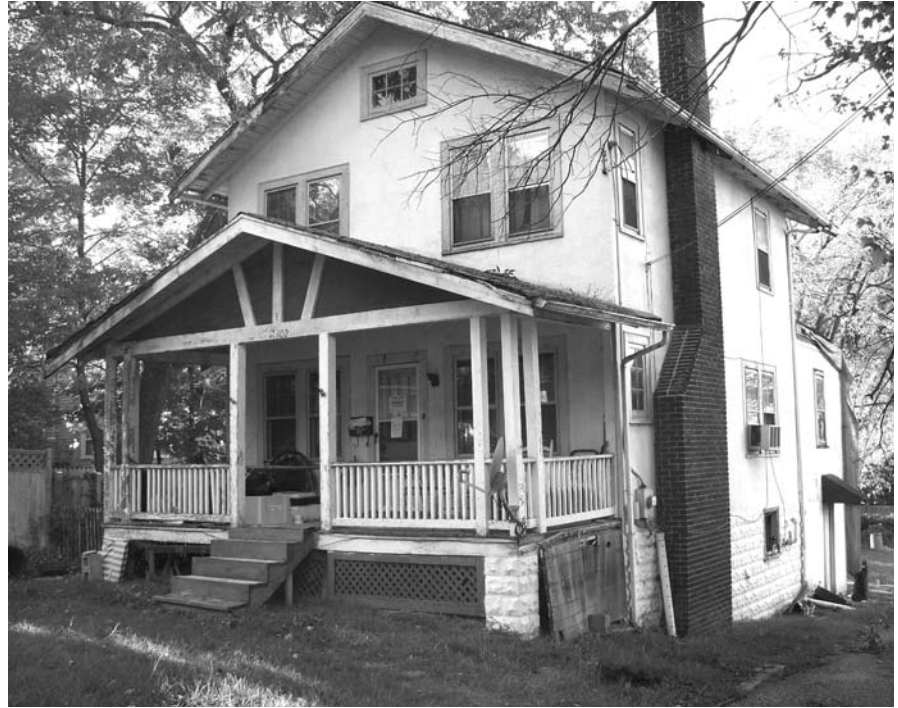
▲ 7402 Hancock Avenue.

In August, the City removed the 6502 Sligo Mill Road house from the original Request for Bids after a determination was made that the City did not have the authority to demolish the circa-1900 structure. HTI learned subsequently that the property is owned by a Florida development company that plans to demolish the house and then sell the vacant lot to Montgomery County, which will add the land to the existing parkland adjacent to the property. HTI board members inspected the house and determined