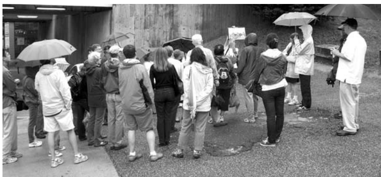
▲ Walking tour participants were undeterred by rain.

covered sites in both DC and MD, and concluded inside the Takoma Park Seventh-Day Adventist Church with a talk on Adventist history in Takoma Park. Since historical education is one of Historic Takoma's most important contributions to the Takoma community and is an essential component of the organization's mission, HTI was pleased to be able to participate in this event.