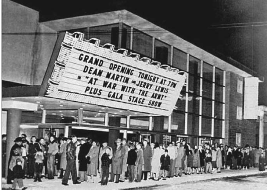
▲ The Allen Theater in its heyday.