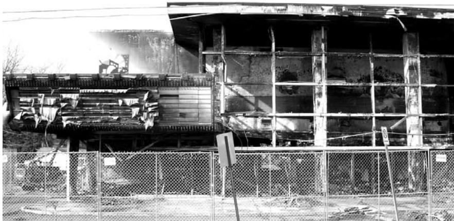
▲ After the fire.