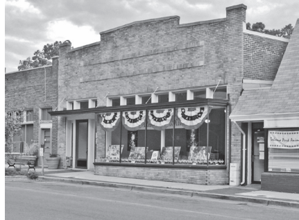
Historic Takoma's new home at 7328 Carroll Avenue in Takoma Junction.