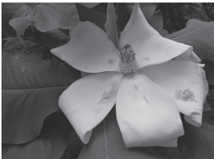
Tara magnolia ashei, featured on this year's House and Garden Tour. Recap on page 1.

Historic Takoma, Inc. PO Box 5781 Takoma Park, MD 20913