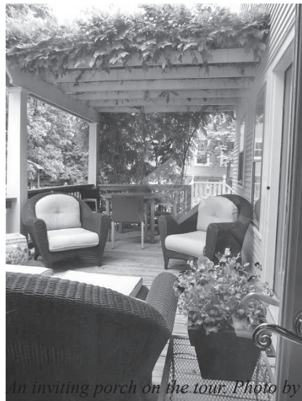
An inviting porch on the tour.

She loves the search for the small details that identify a kit home that’s been renovated, updated, and improved beyond recognition. “It’s more than just the detective work,” she says. “Houses are carriers of emotion.”