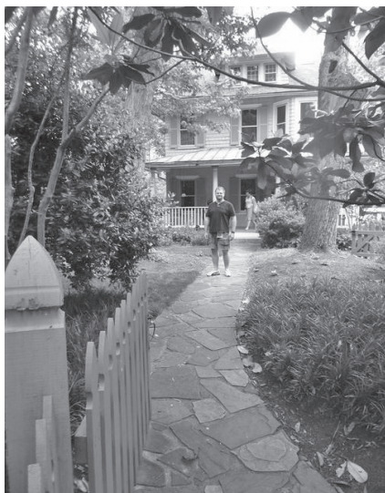
One of several bungalows on the tour.

See our Visitors Guide on the back page.