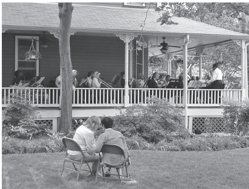
A wraparound porch never looks more elegant than with a band.

After 17 years in its original location, the owners faced a crisis when their 1907 home was slated for