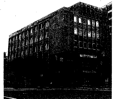
The Perpetual Building located at 8700 Georgia Avenue, at the corner of Cameron Street.

HTI has concurred with the nomination of the Perpetual Building to be worthy of designation on the Montgomery County Master Plan and the National Register of Historic Places. The five-story Postwar International style building is located at 8700 Georgia Avenue, at the corner of Cameron Street. The building cost $1.5 million to build and opened in 1958. The building housed the Silver Spring branch of the DC based Perpetual Building Association. It was built and designed by the Bank Building and Equipment Corp. of America, in collaboration with well known DC architect and builder Robert O. Scholz. The Silver Spring Historical Society and other groups are attempting to discuss with the current owner ways to reuse this important community landmark or to incorporate it into new construction.