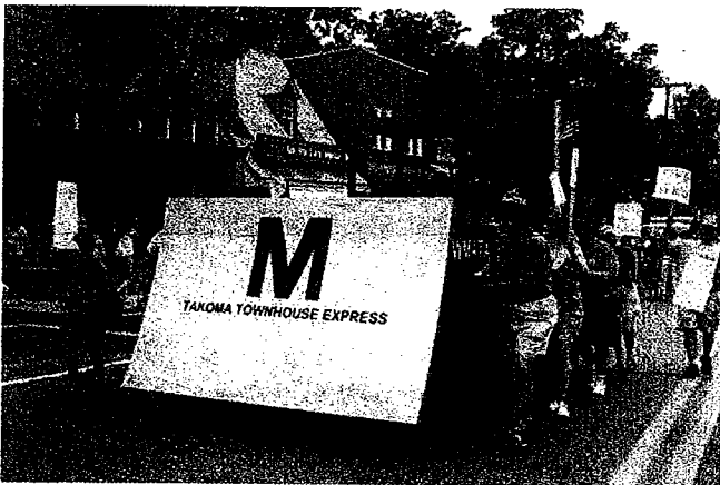
Takoma Park citizens staged a protest at the Fourth of July Parade against the bulldozing tactics of WMATA in trying to force development on the community.