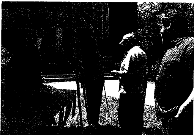
Tickets for the House and Garden Tour were sold in front of the community's Carnegie library at Fifth and Cedar Streets, NW.